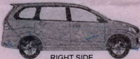
RIGHT SIDE SISI KANAN