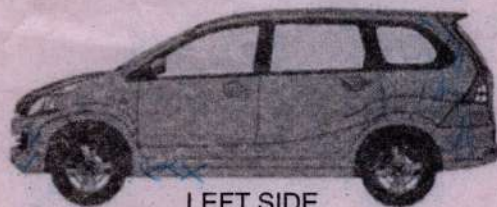
LEFT SIDE SISI KIRI